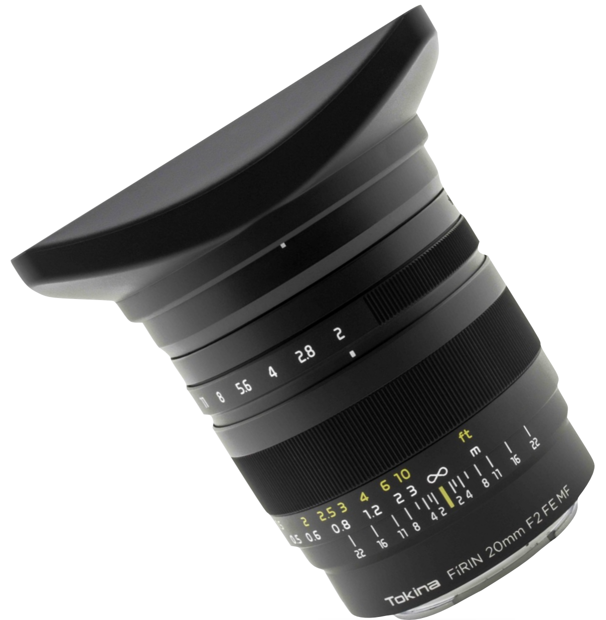
FIRIN 20mm F2 FE MF for SONY A7 full frame E-mount lens

We are glad to present the first lens in Firin series - 20mm F2 FE MF for SONY A7 full frame E-mount.